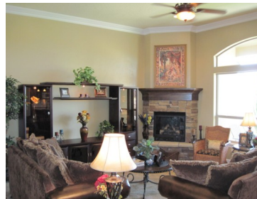
557 E. San Pedro Street, Meridian